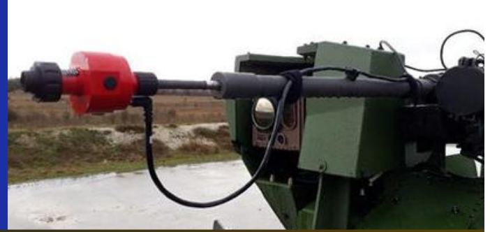
Example of use of a calibrated rod with a LDB-V