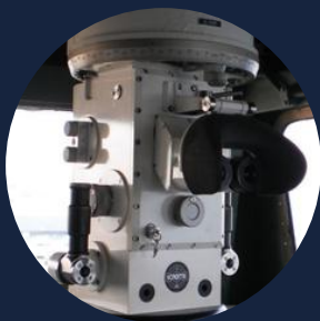
→ Example of an Elynxo periscope integrated on a French vessel.